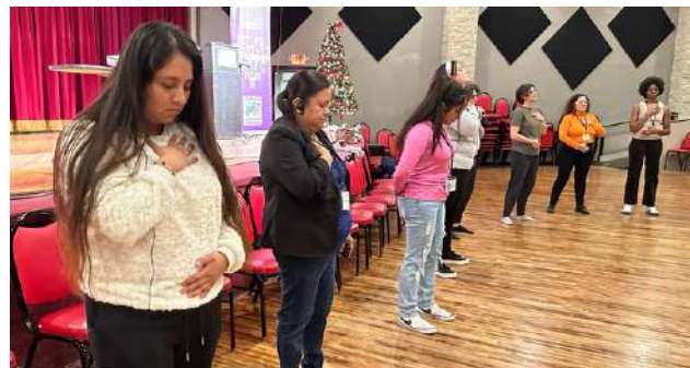
RURAL WOMEN'S ASSEMBLY