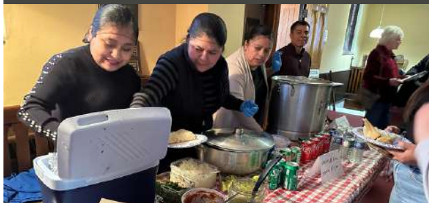
LAS CHEFS LATINAS COOPERATIVE