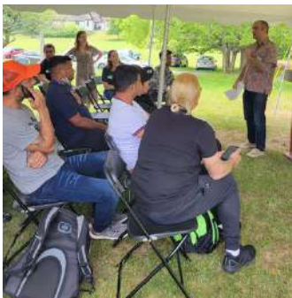
GATHERING FOR REFUGEES