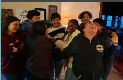
YOUTH ARTS GROUP (YAG)