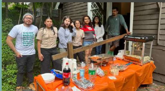
YOUTH ECONOMIC GROUP (YEG)