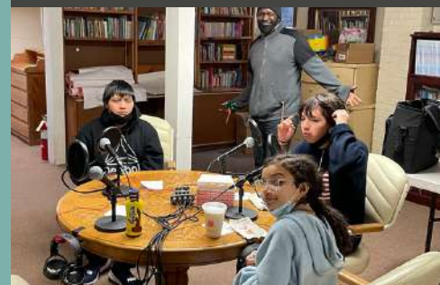
VOICES OF LONG ISLAND YOUTH (VOLIIY)