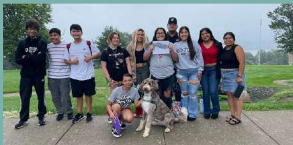
COLLEGE PREP PROGRAM