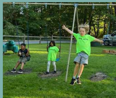
SUMMER OVERNIGHT LEADERSHIP CAMP