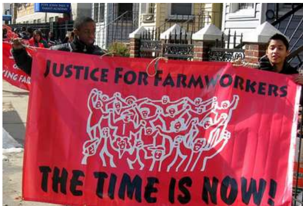
JUSTICE FOR FARMWORKERS