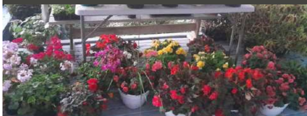
LONG ISLAND FARMWORKER COOPERATIVE