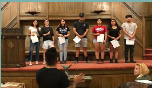
JUSTICE ORGANIZATION OF YOUTH (JOY)