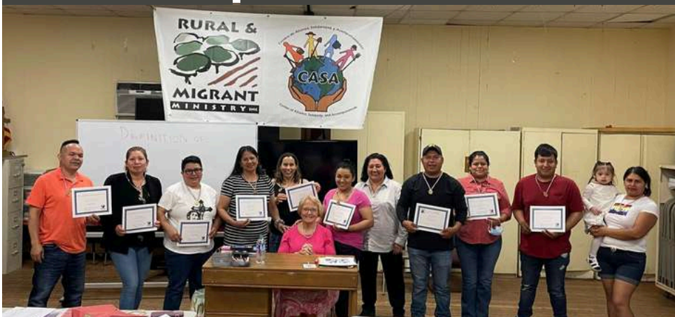
CENTER OF ALLIANCE, SOLIDARITY, AND ACCOMPANIMENT (CASA)