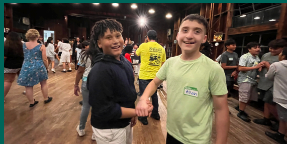
SUMMER OVERNIGHT LEADERSHIP CAMP