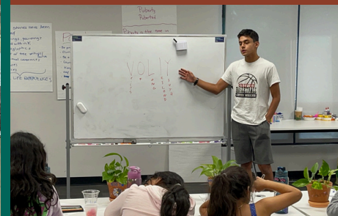
VOICES OF LONG ISLAND YOUTH (VOLNY)