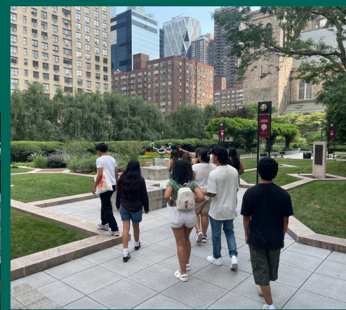
COLLEGE PREP PROGRAM