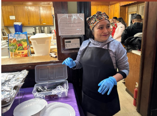
LAS CHEFS LATINAS COOPERATIVE