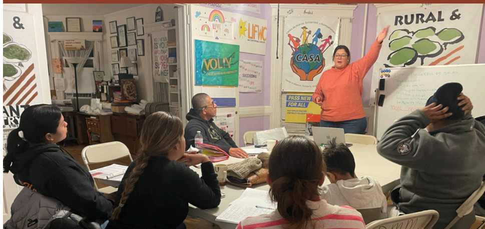
COMMITTEE FOR EQUITABLE AND INCLUSIVE EDUCATION