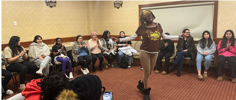
RURAL WOMEN'S ASSEMBLY