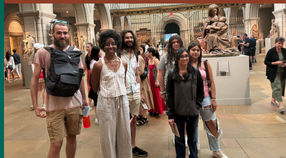
YOUTH ECONOMIC GROUP (YEG)