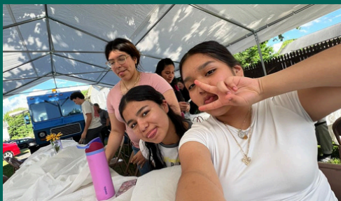
JUSTICE ORGANIZATION OF YOUTH (JOY)