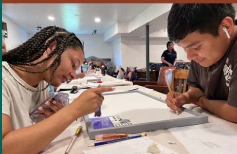
YOUTH ARTS GROUP (YAG)