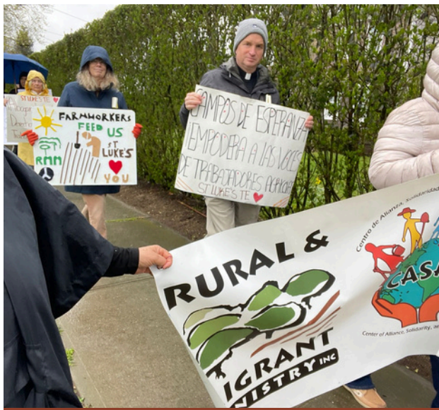
JUSTICE FOR FARMWORKERS