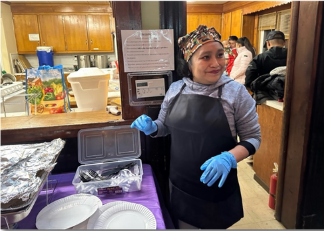
The women's cooking cooperative Las Chefs Latinas caters meals for our Justice Celebration.