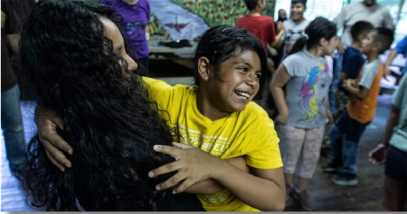
Overnight Camp.