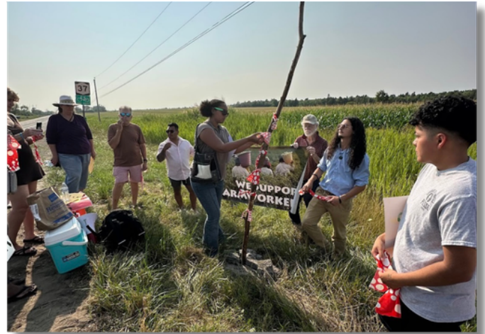
Save New York's Rural Economy: A Caravan of Empathy, at a vigil in Louisville, NY.