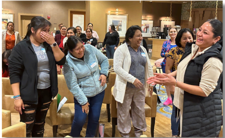
The Rural Women's Assembly is a weekend of learning, sharing, sisterhood and fun.

RMM's Rural Academy of the People (RAP) offers a variety of adult education programs that are initiated and designed by rural, grass-roots leaders. RAP brings people together to learn from one another through participatory education, in which people learn by doing. As adults who are often excluded from traditional education models, rural and farmworking individuals seek alternative ways to learn, grow and develop skills. RMM helps people to expand their knowledge by offering ESL and literacy classes, Know-Your-Rights workshops, supporting the development of business cooperatives and numerous other programs.