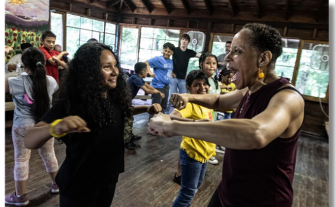
Campers learn an African dance.

For more than 35 years, Rural & Migrant Ministry has offered cutting-edge, creative and effective programs that support emerging leaders, ages 8 to 18, in rural New York. Each of RMM's youth programs has been created and carried forth by young leaders. These programs form a network across New York that helps members connect to each other, to resources, allies and opportunities. The programs, which include the Summer Overnight Leadership Camp, Summer Day Programs, High School Leadership Programs, College Prep Program, and Youth Leadership Institutes, are unique, and in some cases, nationally recognized.